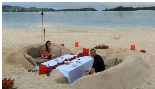
A picnic on the beach.